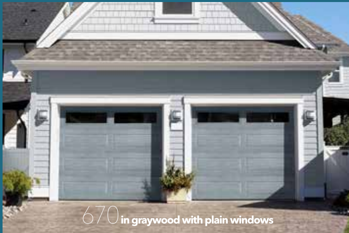
670 in graywood with plain windows