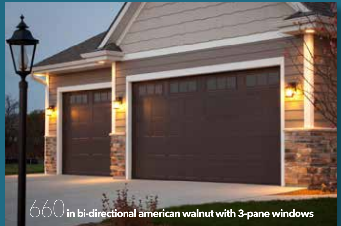
660 in bi-directional american walnut with 3-pane windows