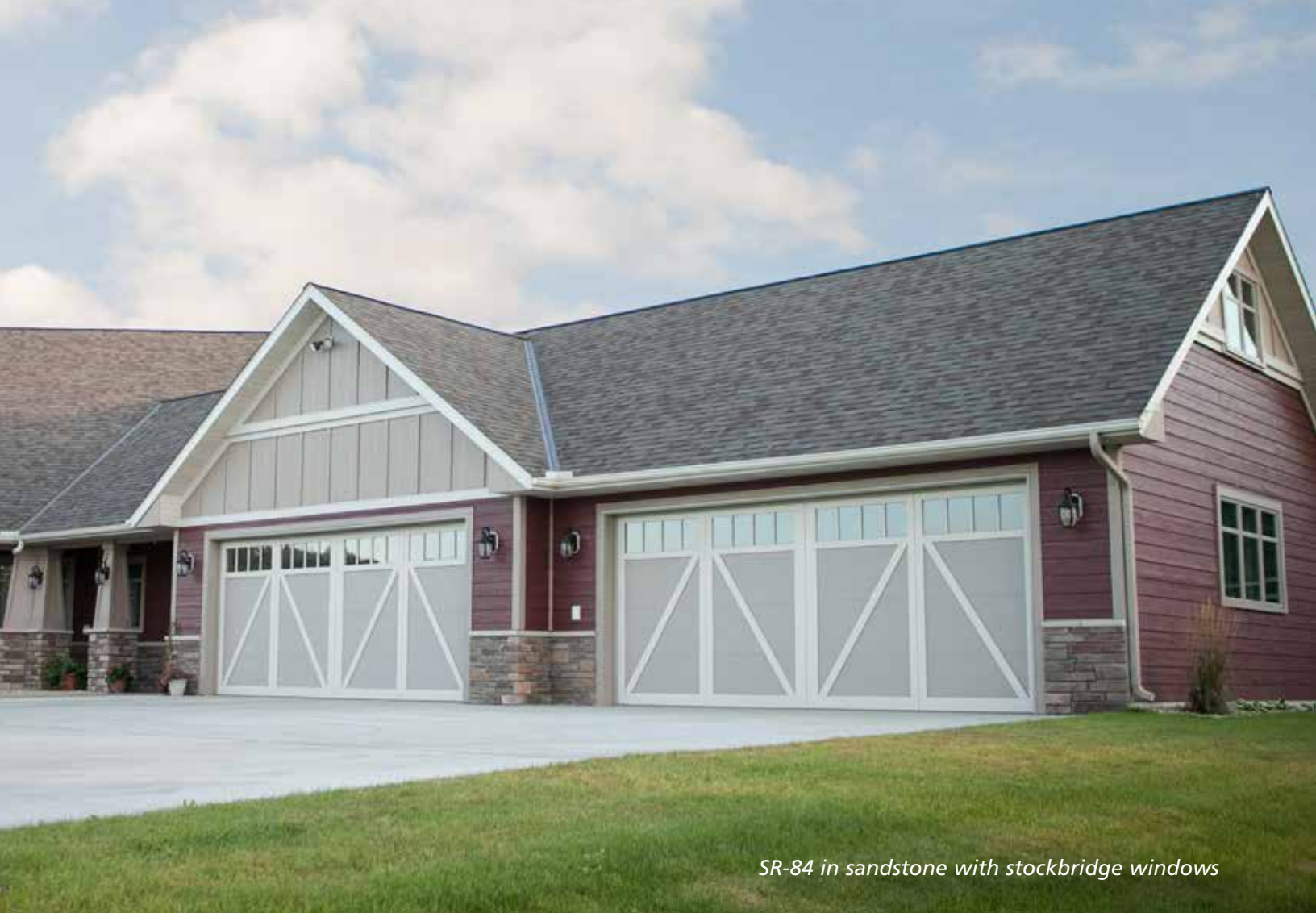
SR-84 in sandstone with stockbridge windows

With classic beauty, durability and thermal efficiency, your home will be The Talk of the Town!