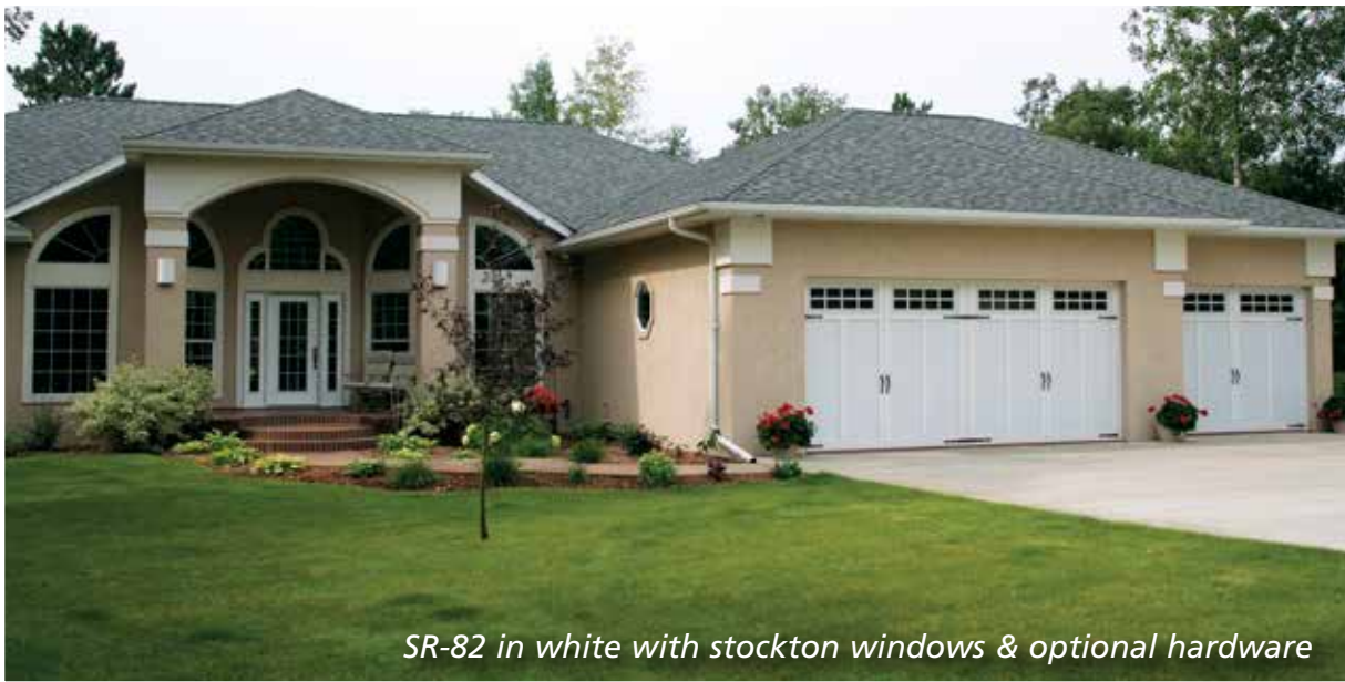
SR-82 in white with stockton windows & optional hardware