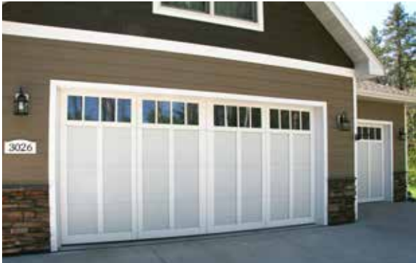
SR-82 in white with stockbridge windows