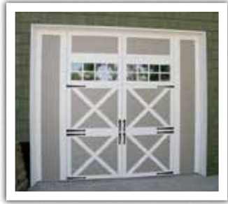
Custom Creation: Shown in Sandstone with Stockton windows