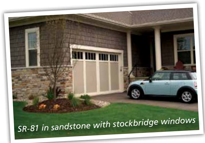
SR-81 in sandstone with stockbridge windows

With six distinctive styles, nine classic colors and your choice of windows, you'll be able to create the perfect look to complement your home's architectural style and make it uniquely yours.