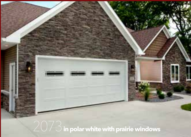
2073 in polar white with prairie windows

2010 in cedar plank with slimline windows and selectview option (see pg 22)